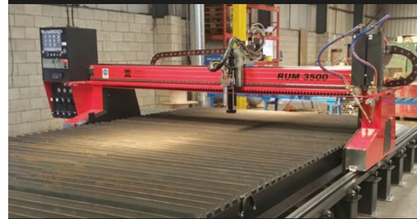
RUM - for wider and heavier applications with oxy-fuel and plasma